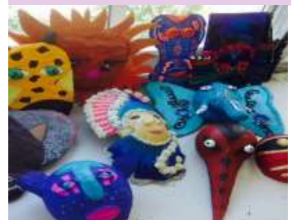
Tribal Masks by Year 10